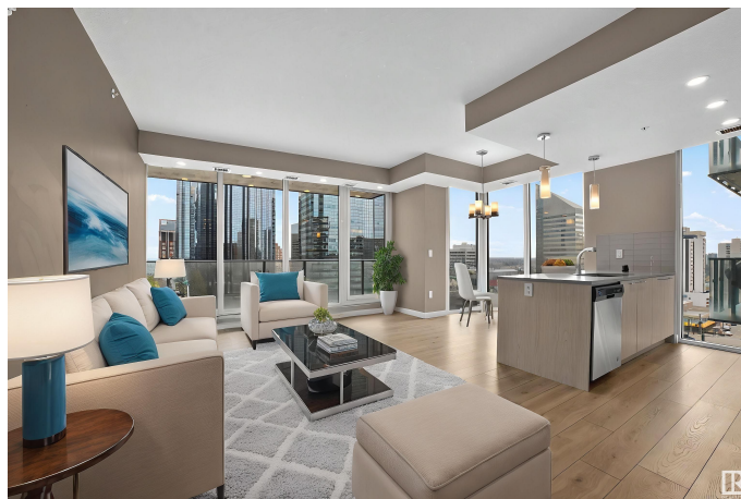
1404-10180 103 St NW, Edmonton, AB

Main Floor Exterior Area 940.00 sq ft Interior Area 869.00 sq ft